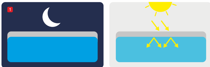
Fig. 1 Without UV barrier addition