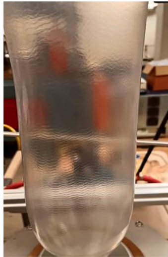
Blown Film Without Process Aid

Our efforts to bring a more sustainable approach to product design, have resulted in the industry's best fluorine-free polymer Processing Aid.